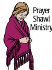
Prayer Shawl Ministry

KEARNEY, NE : Spirit Catholic Radio invites you to hear Catholic Answers Senior Apologist, Tim Staples , speak on “Living Bread” at Prince of Peace Church on Wednesday, July 27, at 7pm. Tim Staples defends the Real Presence of our Lord in the Eucharist using Scripture, Tradition and the Magisterium of the Church in a way that will make this core belief of the Catholic Faith come alive in your spiritual life. Tickets are $5, or bring your friends and reserve 5 tickets for $20! Tickets can be purchased at spiritcatholicradio.com